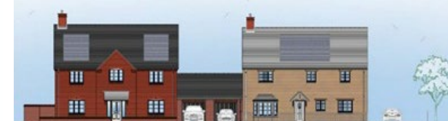
Street Scene - Plots 1 & 2