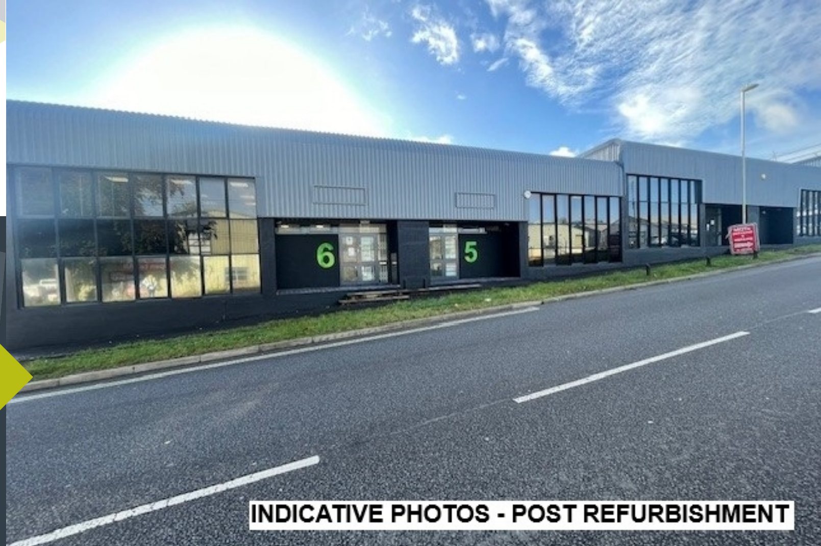
INDICATIVE PHOTOS - POST REFURBISHMENT