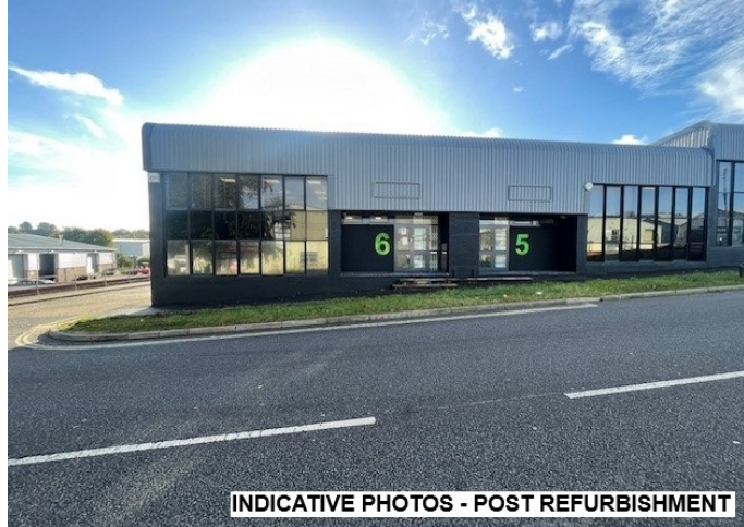
INDICATIVE PHOTOS - POST REFURBISHMENT