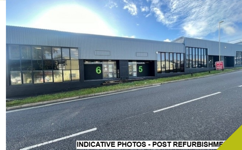
INDICATIVE PHOTOS - POST REFURBISHMENT